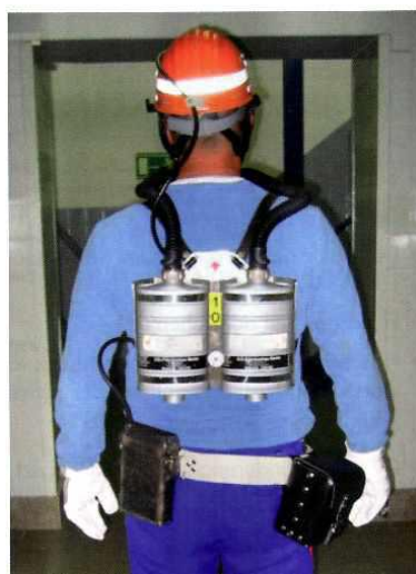
Fig. 3 Two-container arrangement of carbon monoxide filters on the back carrier

A possible two-container arrangement of carbon monoxide filters on the back carrier is shown in Figure 3 [3]. This arrangement is chosen in order to reduce the breathing resistance of a working self-contained breathing apparatuses filtrating carbon monoxide.