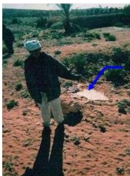
Fig. 6 A well of a foggara in the oasis of Lahmar

The vocation agro pastoral oasis Lahmar is located 30 km from the town of Bechar. The existence of permanent water points allows the oasis to have self-sufficiency in agriculture. The sources of water are drained by 4 foggaras which are located in the northern part of „ksar“. These are Aine Djemal, Omran, Tawrirt and Lahmar. The Tawrirt foggara, the largest of them, includes 18 wells to a maximum depth of 25 metres. The smallest one, Omran, includes 4 wells, 6 metres in depth (Fig. 6). At the end of foggaras, the water is stored in the collective “madjens” (Fig. 7). At the end of “madjens”, each owner receives its share of water through „seguias“. The irrigation of gardens goes in turn. In the oasis of Lahmar, there are 24 families and their descendants who are affected by these water rights. The unit of measurement used in the oasis of Lahmar is “tanast” which corresponds to 45 minutes. Because of the contribution of modern techniques and inheritance issues, the foggaras have been abandoned.