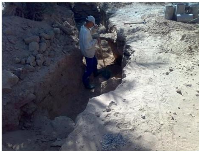
Fig. 5 Rehabilitation of „seguias“ in the oasis of Beni Ounif