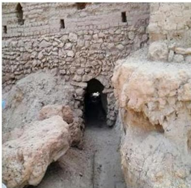
Fig. 2 Output of a foggara below the „ksar“of Ouakda