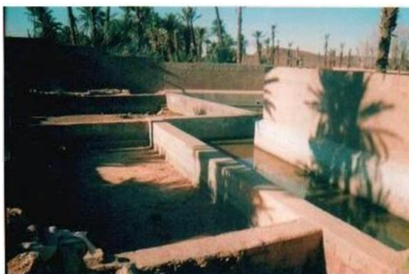
Fig.7 A “madjen” in the oasis of Lahmar