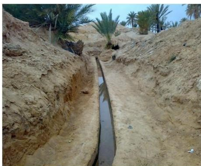
Fig. 4 Seguia in the oasis of Beni Ounif