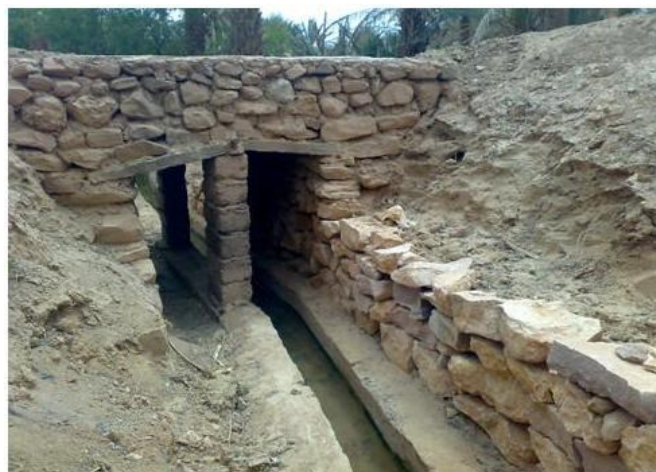
Fig. 3 Output of a foggara of the oasis of Beni Ounif