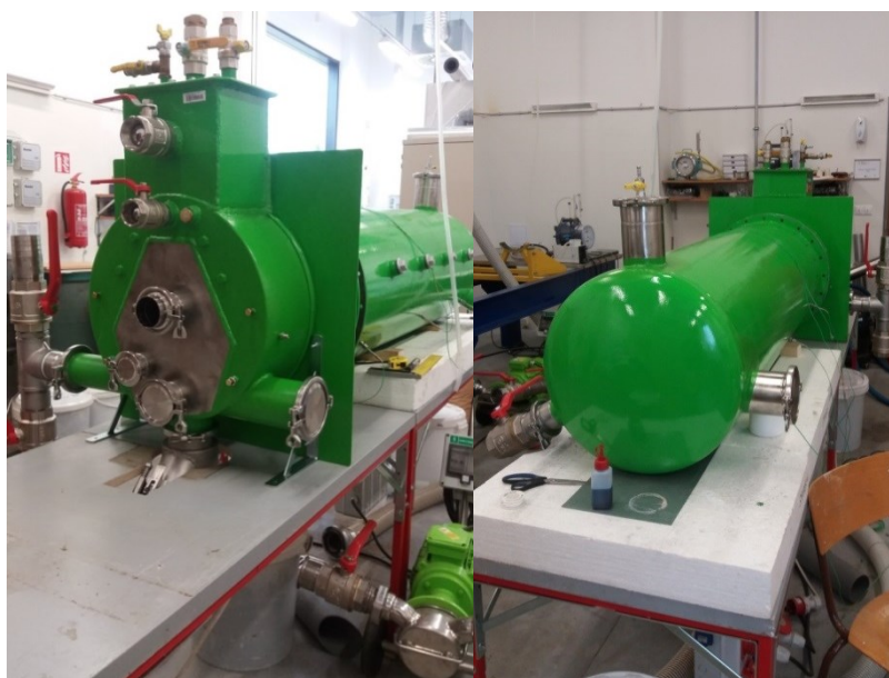
Fig. 2 Laboratory bioreactor in development.

The bioreactor is tempered to the operating temperature by means of up to six resistive electrical heaters originally intended for heating 3D printers. The heaters are connected to the outside of the reactor tube and powered by up to six switching power supplies (12VDC/12 A). The power supply cabinet is located next to the reactor. The thermostatic control is performed by means of six thermocouple probes in the range of 5 °C above ambient to 70 °C. The operating temperature is typically set to 40 \pm 2 °C or 55 \pm 2 °C. By changing the combination of active thermocouples and their location, temperature equalization throughout the volume of the batch can be achieved. The reactor is thermally insulated using panels of expanded polystyrene foam (100 mm in thickness). The insulation forms a container. Only the front part of the technological forehead with the biogas trap is left without insulation. Photographs of the reactor are shown in Figure 2.